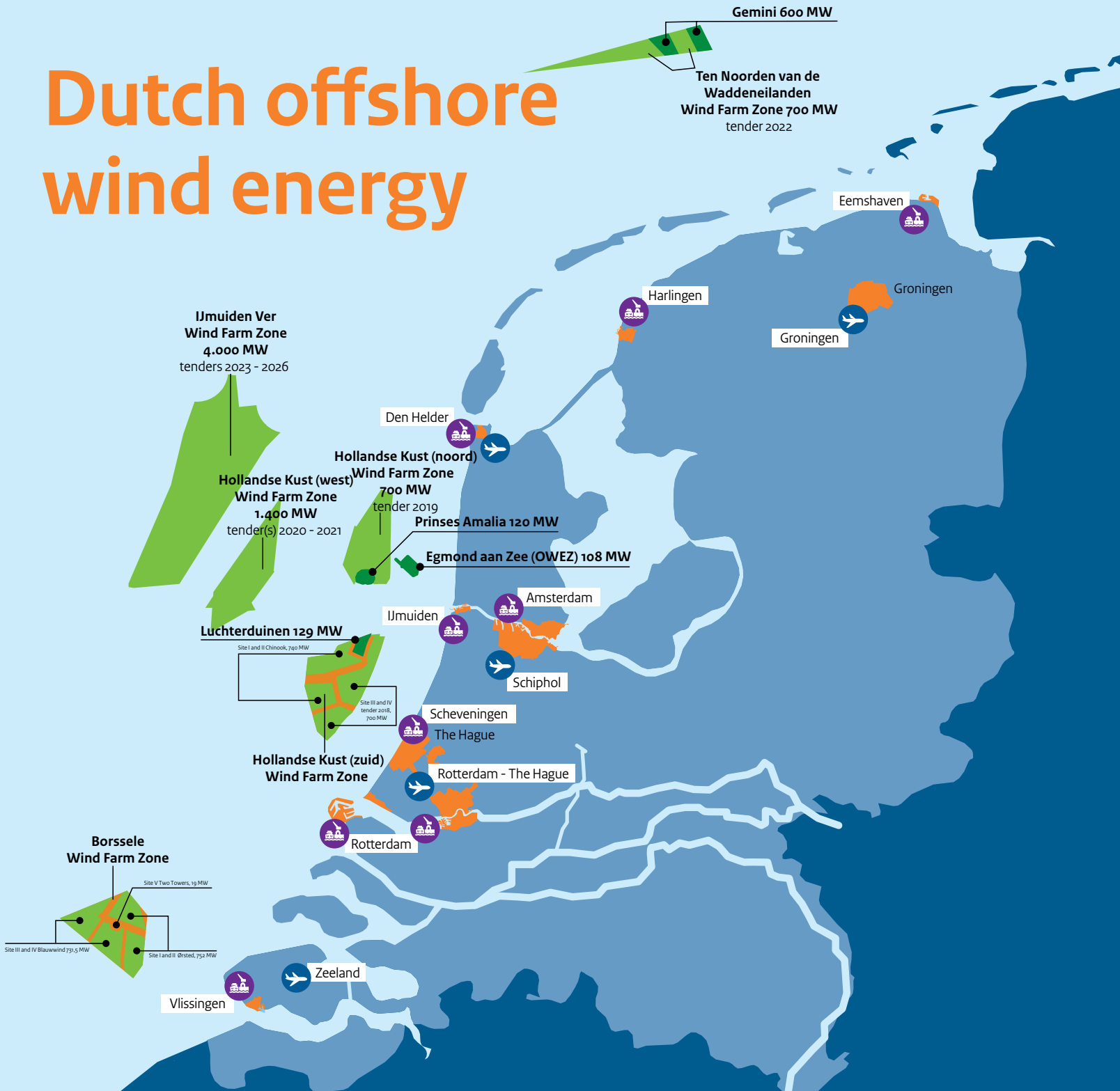
Dutch offshore wind capacity (planned)